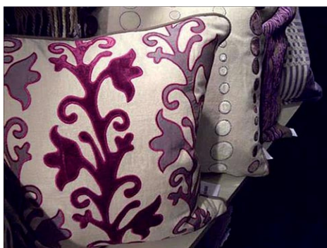
Purple and Grey: The dominant palette at Maison&Objet as seen in this William Yeoward cushion

With an entire hall dedicated to fabrics , M&O éditeurs unveils the best and latest collections from over 150 prestigious international brands. It was fabric heaven and we were not disappointed! There were plenty of rich silks, brocades and damasks. However, in stark contrast to the leaning towards all things wholesome and natural, technology innovations and new fibres are revolutionizing the textile industry resulting in fabrics being used in ways previously not possible.