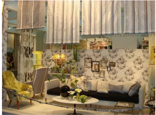
The use of combinations of fabrics has returned as well shaking up the monotony of too many tonal fabrics

The fabrics that will be showing up in our sample books are wondrous and crazy. They will give your workrooms fits while satisfying your client's desire for a mega-sensory experience. Look for nets, knits, holographic printing, lacquered finishes, outdoor jersey, mixed media applications, felting, double weaves and genius jacquards. Think patent leather stripes appliquéd on tulle. Hi-tech, raw and natural fabrics are mixed to emphasize surface texture, contrasting matt and shine, sleek and tailored alongside rough dimensional weaves.