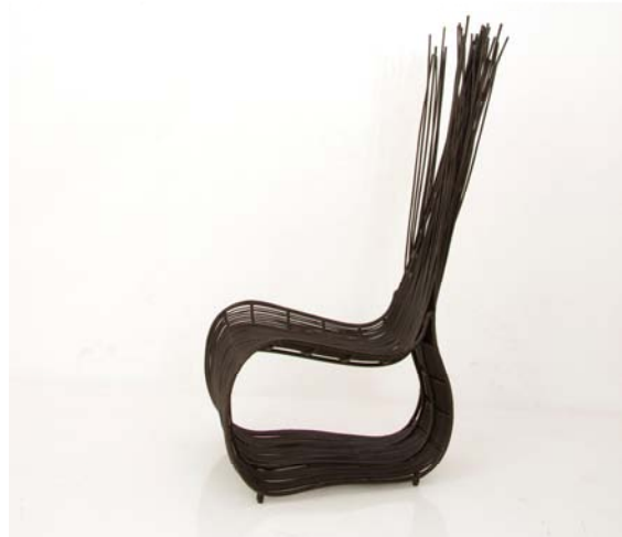
Yoda Chair Black

For more information and store details, visit www.veylandts.co.za □