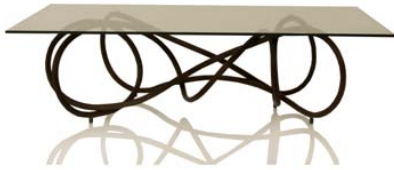
Noodle Coffee Table

“Kenneth’s use of natural sustainable materials including bamboo, wood, abaca and rattan, and his responsible production methods perfectly encapsulate the Weylandts design philosophy,” says Weylandt.