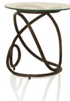
Noodle End Table