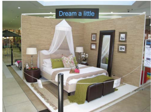
Brigitte Hills Bedroom

The aim was to only use items that are available from the stores at Moffett on Main in order to promote the centre.