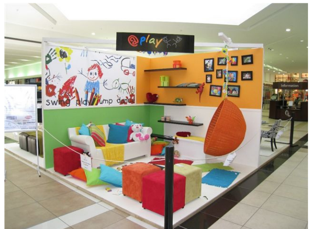
Kirsty Crowe Playroom